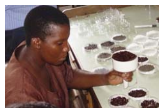
Preparing SP seed for pre-germination in the laboratory