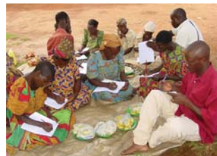
On-farm taste evaluation of sweetpotato (SP)

work with the private sector for SP value addition. Recipes for products like cakes have been developed and promoted by stakeholders.